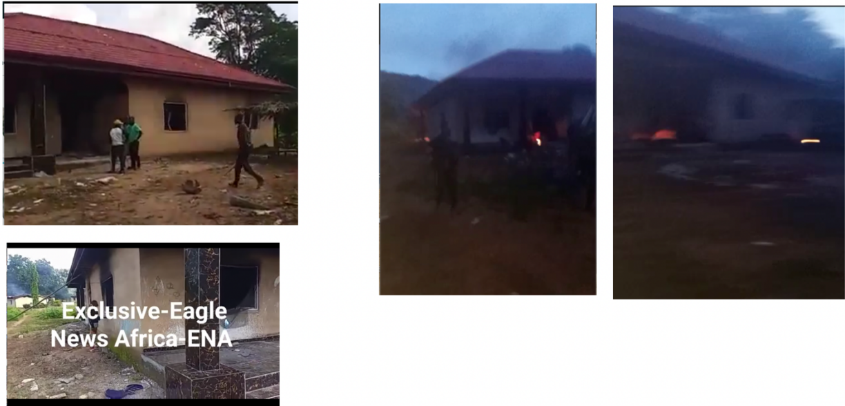
Exhibit 2: Comparison of frames from “aftermath” video (left) to Manyu Unity Warriors attack video (right)

These two geolocations demonstrate that the Manyu Unity Warriors incident occurred in Ballin, at the location of the aftermath video.