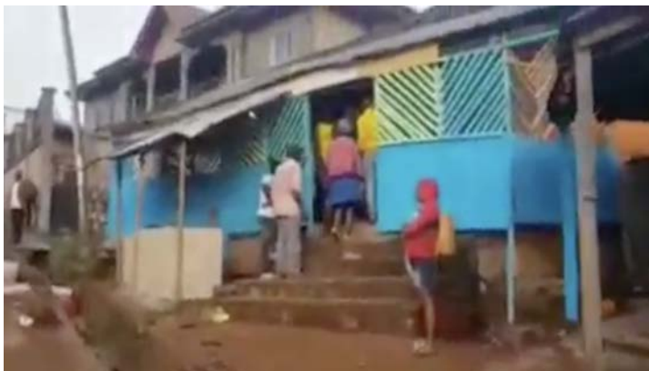
Figure 1: Screenshot from Video 1

Video 1 begins on a crowded market street, at the left end of which is a billboard. On the right, across from the billboard, is the drinking spot, with another road extending past it. Video 1 also gives a look down that road.