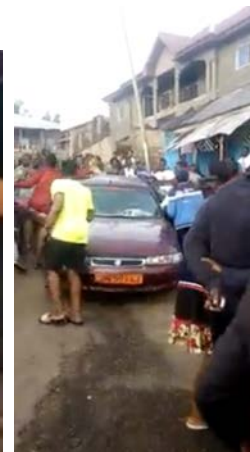
Figure 2: Screenshot from Video 1