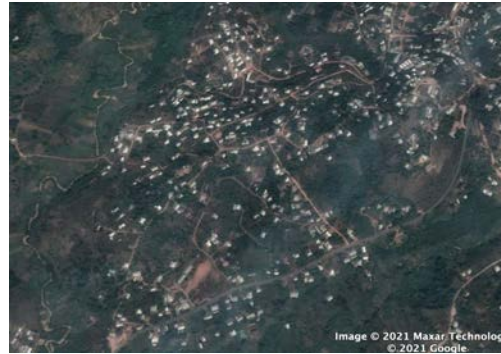
Figure 4: Google Earth Pro satellite image of Nsongwa