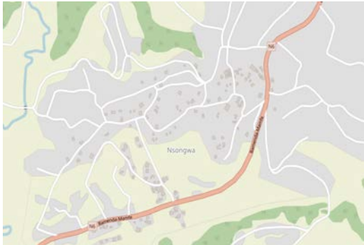
Figure 3: Screenshot of Nsongwa from OpenStreetMaps

Researchers located Nsongwa using OpenStreetMap, then found it on Google Earth Pro by matching the roads. Searching satellite imagery on Google Earth Pro for landmarks visible in the video, researchers located a match for the drinking spot location at 5°56'0.06"N, 10° 7'42.70"E . This spot is located just outside of Nsongwa, between Mile 90 and Bamenda.