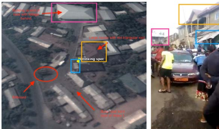
Figure 7: Comparison of several features in satellite image and Video 1

Features visible in the satellite image, including the configuration of roads, distinctive roofs, and other landmarks, were consistent with the area as depicted in Video 1.